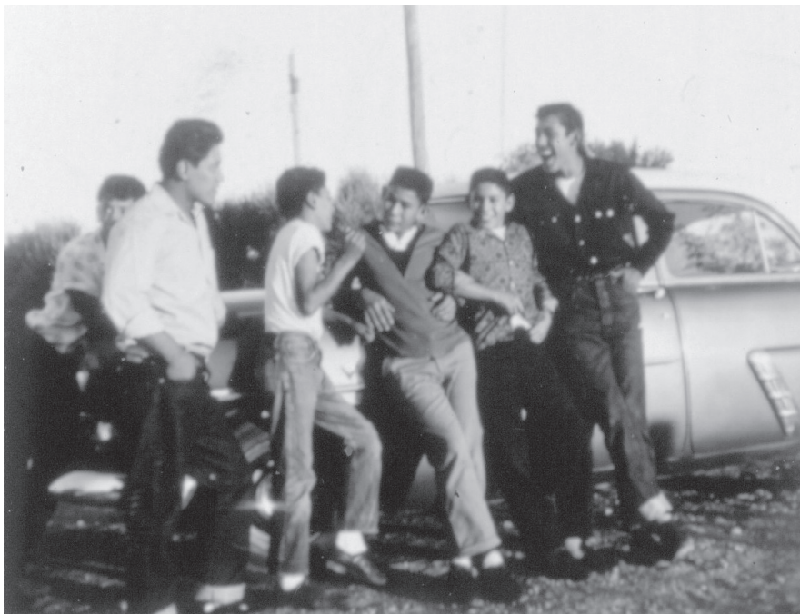
Illus. 4.4. Group of boys in Longmont, beside car