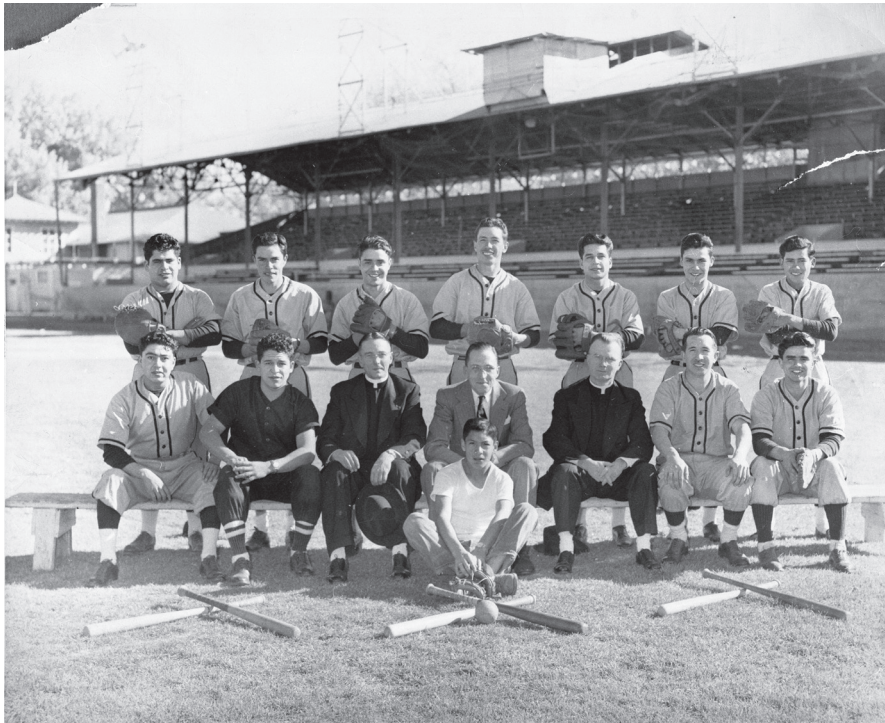
Illus. 4.9. Baseball team organized by St. John's Church, Longmont, 1946?