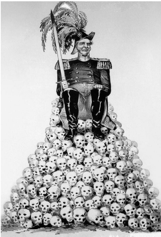
Presidential candidate Gen. Zachary Taylor sits atop a mound of skulls in this 1848 cartoon criticizing his role in the U.S. war against Mexico.